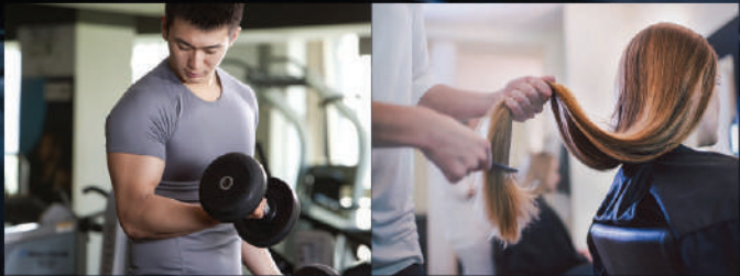
Gym & Health Centres