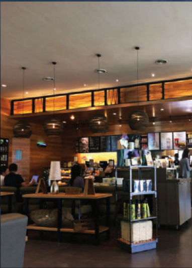
Starbucks Seri Austin

With all its well-connected convenience of surrounding urban amenities, Austin Duta is just minutes away from AEON MALL Bandar Dato' Onn, IKEA Desa Tebrau, AEON MALL Tebrau City, Sunway College Johor Bahru, KPJ Bandar Dato' Onn Specialist Hospital, McDonald's Austin Heights, Starbucks Seri Austin and Austin Heights Water Theme Park and the soon to be completed IKEA's Toppen Shopping Centre, just to name a few.