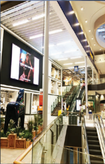
IKEA Desa Tebrau

The business and entertainment conveniences are just a short distance away. Also, nearby are the educational, banking and business centres, conveniently linked to all major roads and highways.