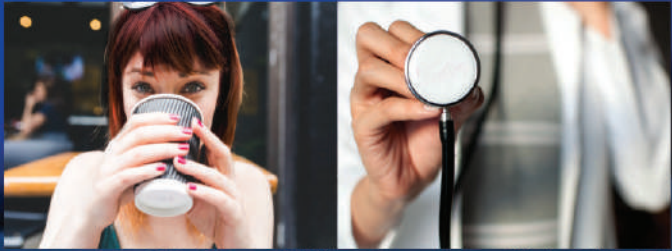
Pubs, Bistros & Cafes