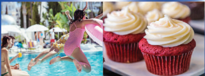
Water Theme Park