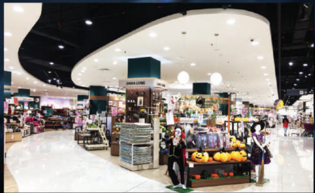
AEON MALL Bandar Dato' Onn