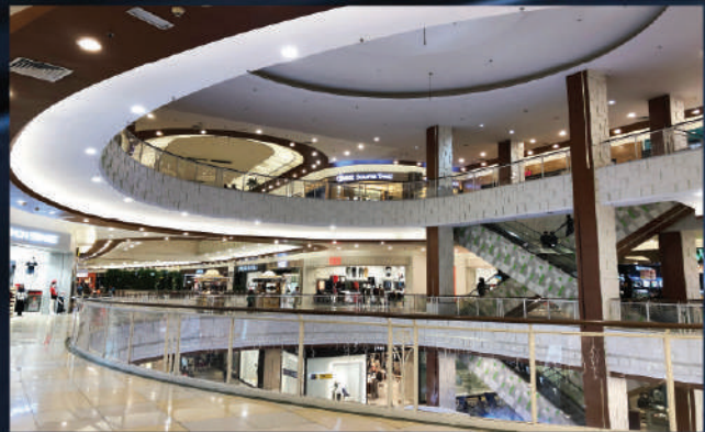
AEON MALL Tebrau City

Austin Duta brings you closer to a multitude of surrounding lifestyle facilities and amenities.