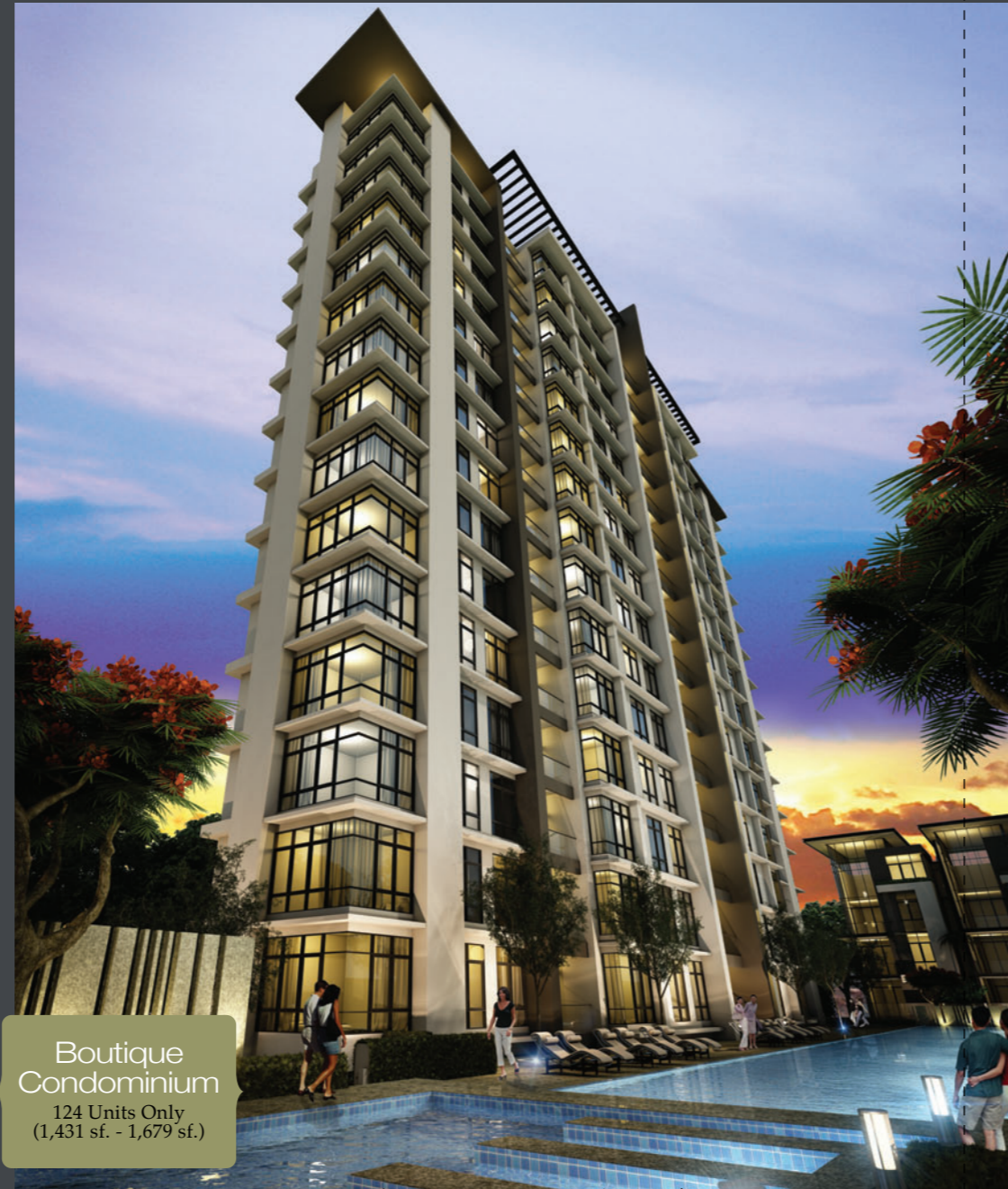
Boutique Condominium 124 Units Only (1,431 sf. - 1,679 sf.)